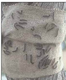
Bob Queen, WI DNR

to make a two-layer skirt. Older caterpillars are attracted to these “skirts” when looking for a place to hide during the day. Remove and destroy the caterpillars each day by scraping them into a bucket of soapy water.