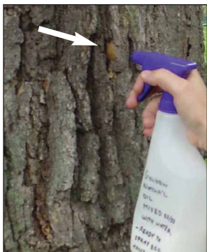
Bill McNee, WI DNR

WINTER (mid-October until mid-April): Destroy egg masses to help reduce the number of caterpillars next spring. Spray with Golden Pest Spray Oil or scrape off and kill the egg masses by microwaving for 2 minutes or by submerging in soapy water for 2 days. Killed eggs may be thrown out in the trash.