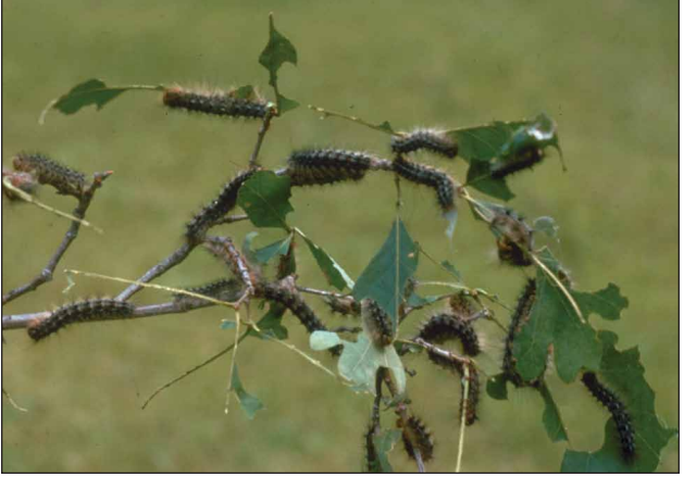
Tim Tigner, Virginia Department of Forestry

Gypsy moth caterpillars usually complete their development in early July. The mature caterpillars then search for a safe place to pupate. This is how gypsy moth pupae and eventually egg masses end up in such odd spots as the undersides of vehicles, behind signs on trees, on buildings, in wood piles, and stone outcroppings as well as in crevices on trees. Once they've found a secure spot, the caterpillar sheds its skin and becomes a pupa. The gypsy moth does not form a cocoon. The pupation stage lasts for approximately 2 weeks before the adult moth emerges.