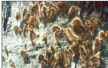
USDA Forestry Service

pairs of warts towards the head are blue, the six pairs towards the rear are red. In addition, the head is dirty yellow with two vertical black bars that look like eyes. Gypsy moth caterpillars are present from May through mid-July.