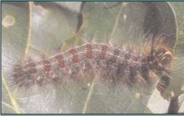
Andrea Diss, WI DNR

Gypsy moth caterpillars have a bristly body with five pairs of blue warts followed by six pairs of red warts running down their back.